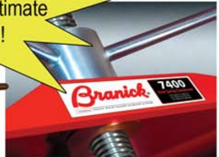
Model 741 Benchmount (Optional)