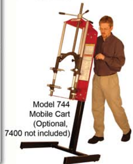
Model 744 Mobile Cart (Optional, 7400 not included)

Model 741 Benchmount.....7400 Not Included Model 744 Mobile Cart.....7400 Not Included