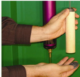
19. Retain the top and bottom filter element caps. Discard old filter.