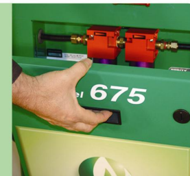
26. Replace the front panel.