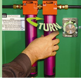
16. Loosen the coalescing filter canister .