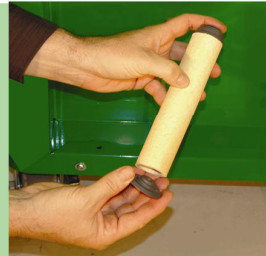
20. Position the top and bottom filter element caps onto the new filter.