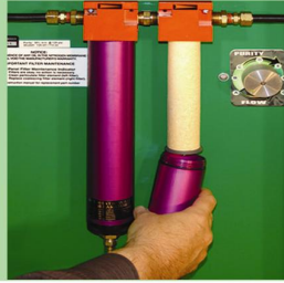
17. Remove the canister from the coalescing filter.