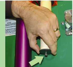
22. Position filter nut (arrow) onto filter.