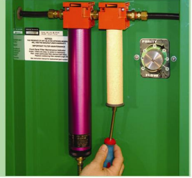
18. Loosen filter element nut using a 5/16" nut driver.