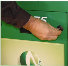
27. Using a coin or screwdriver, rotate each panel lock.