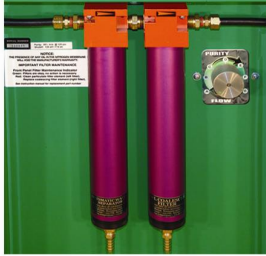
15. The right filter is the coalescing filter.