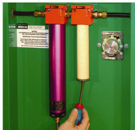
23. Tighten filter element nut. Do not overtighten.