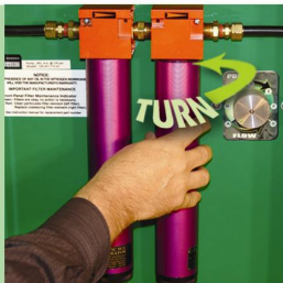
25. ... and hand tighten.