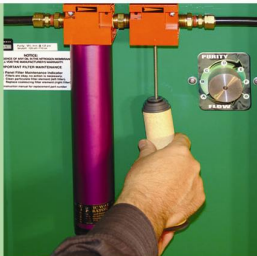
21. Position new filter element and caps onto filter tube.