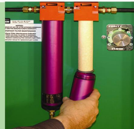
24. Install the filter canister ...